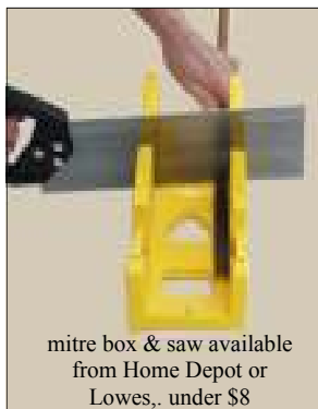
mitre box & saw available from Home Depot or Lowes,, under $8

The greatest amount of build time should be spent determining the panel layout.. Once complete you can draw your panel rectangle on the wall with a pencil. Then measure and mark your corner insets. This is the amount of space needed for each style corners, see the chart to the right.